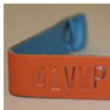
USDA Bangs Tag