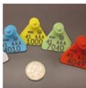
Plastic “41” Tag