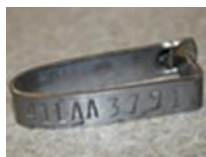
USDA Metal Tag

Finally there are official tags that do not contain RFID chips but have the official 840 number printed on them. We do not recommend their use since this tag is likely to be official for only a short time. An example number for you to have to read and record is 840000123456789.